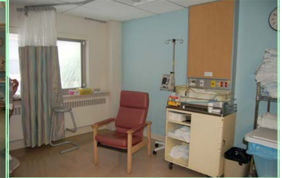
The temporary Special Care Nursery has been nestled in room 26/42.